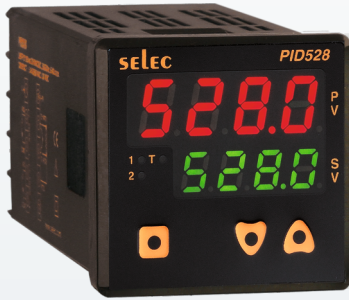
48 x 48mm