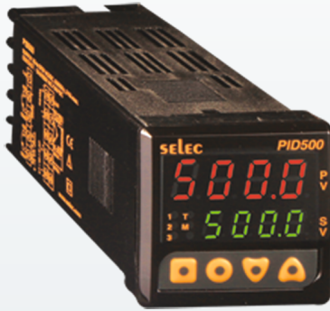
48 x 48mm