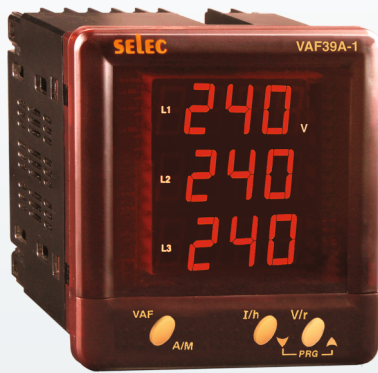
96 x 96mm