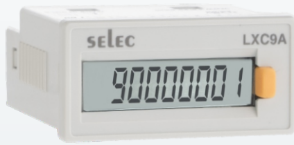
24 x 48mm